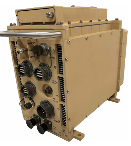
SRC9061 Side View