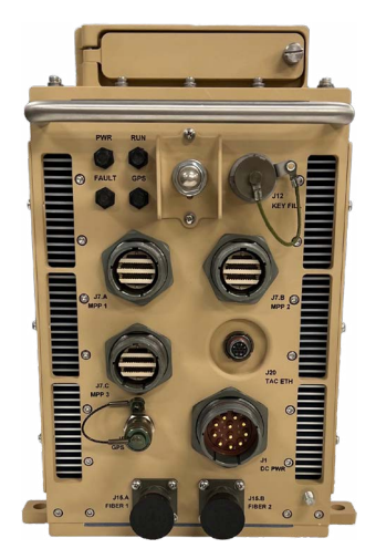
SRC9061 Front Panel View