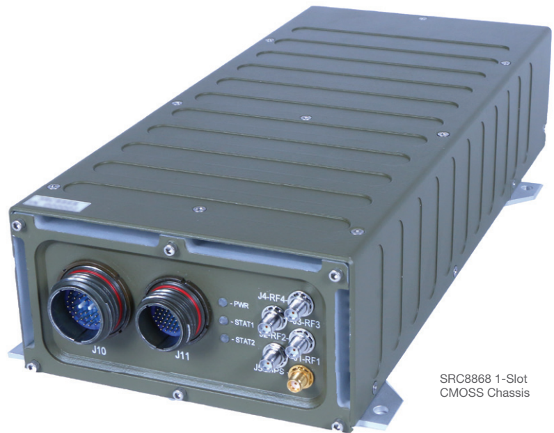
SRC8868 1-Slot CMOSS Chassis