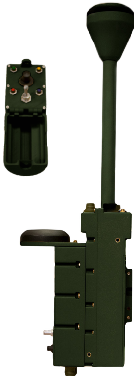
BELOW: The Silent Cyclone system and remote control unit

To purchase, or for more information, please email inquiries@srcinc.com .