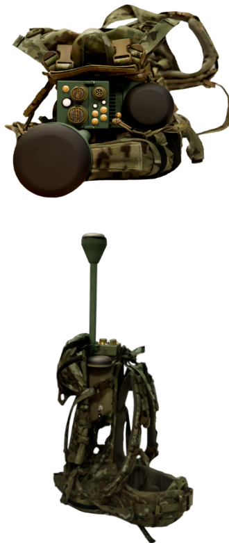
BELOW: Images showing various angles of the Silent Cyclone backpack system