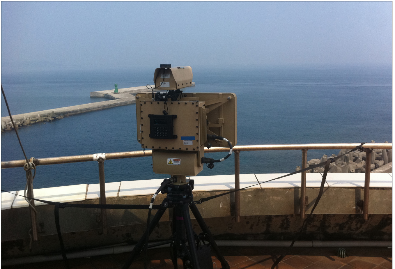
SRC's SR Hawk radar providing coastal surveillance for port and harbor security. Photo provided.