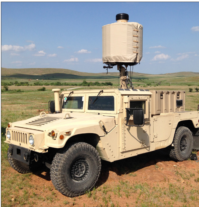
SRC developed the AN/TPQ-50 counterfire radar for the U.S. Army. This radar provides early warning to soldiers of incoming mortar so they can seek shelter. More than 400 of these radars have been delivered to the Army and they have helped saved many lives.